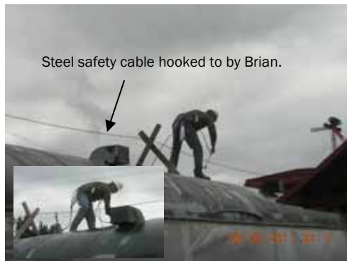
Steel safety cable hooked to by Brian.

Between storm clouds Brian Plotner and Leonard were able to mask SP RPO 5132. After a good deal of patching and scraping, Brian then applied two coats of oil based paint to the roof. Brian had done the entire car 3 years ago but found that the base coat of aluminum